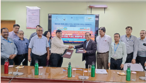
MOU Signing at IISCO Steel Plant (ISP)