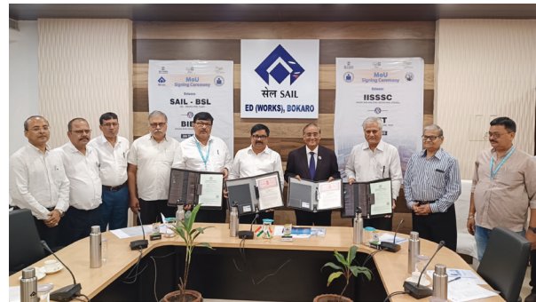
MOU Signing at Bokaro Steel Plant (BSL)