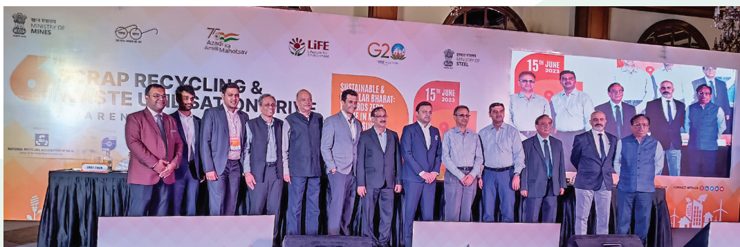
Scrap Recycling and Waste Utilisation Drive Seminar at Taj Bengal, Kolkata