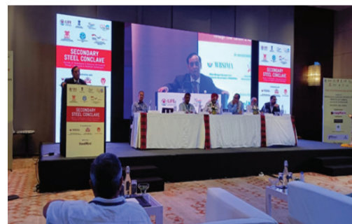
CEO, IISST addressing the audience at a Seminar on Secondary Steel Conclave organised by National Institute of Secondary Steel Technology (NISST)