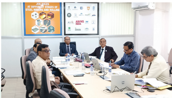
The Board Meeting of IIS SSC. GC members reviewing of progress & discussing the future activities of FY 23-2024