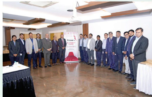
IIS SSC Board Meeting at AMNS INDIA, Hazira