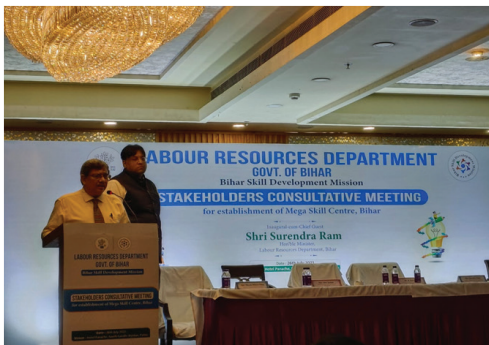
Presentation at Bihar Skill Development Mission (BSDM)