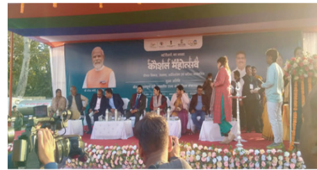
Apprenticeship Mela and Workshop at different parts of country in January - March 2023