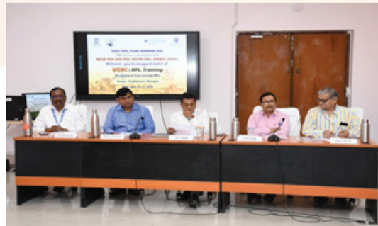
Presentation at Different plants of SAIL