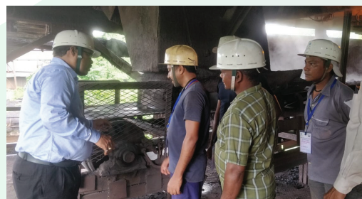
Candidates are getting theoretical & practical lessons during training program in SAIL Steel Plant