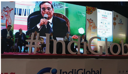
CEO delivering Speech at Indi Global Summit, Guwahati.