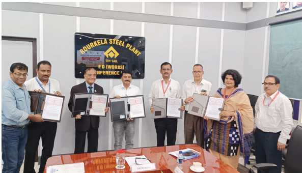
MOU Signing at Rourkela Steel Plant (RSP)