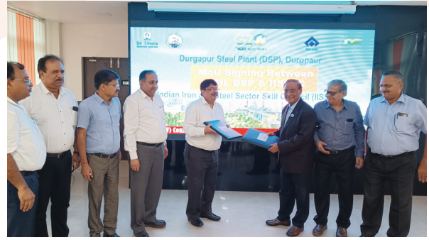
MOU Signing at Durgapur Steel Plant (DSP)