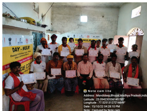
Training & Certification program under MP NULM Scheme for the Logoria community in Madhya Pradesh.