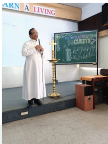
Father of DON BOSCO Technical Institute, Park Circus, Kolkata delivering speech to the candidates