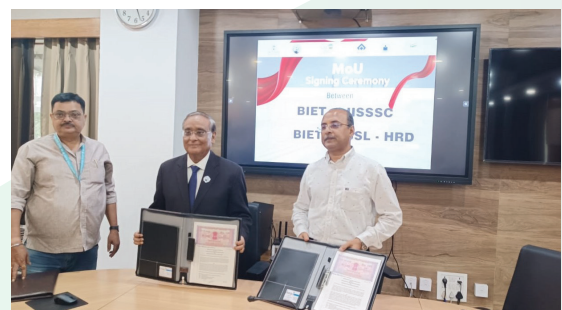
MOU has been signed between Indian Iron & Steel Sector Skill Council (IISCC) & Bokaro Ispat Educational Trust (BIET) Bokaro