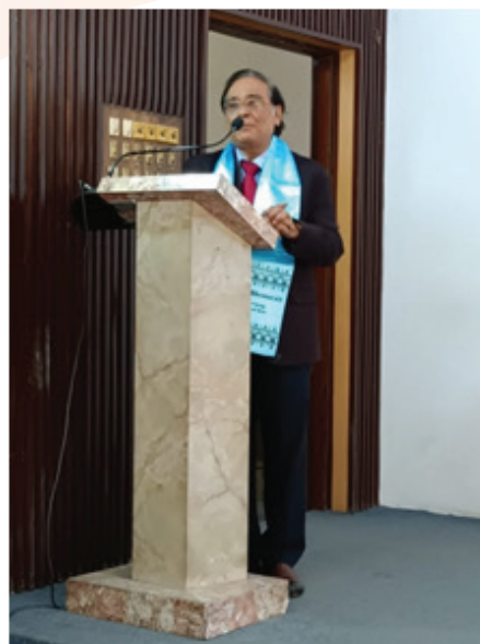
CEO, IIS SSC encouraging to the candidates for Apprenticeship at DON BOSCO Technical Institute, Park Circus, Kolkata