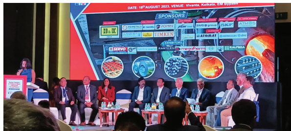
Panel discussion at National Conference on Technology