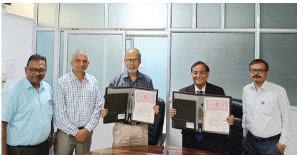
MOU has been signed between Indian Iron & Steel Sector Skill Council (IISCC) & National Institute of Advanced Manufacturing Technology (NIAMT)