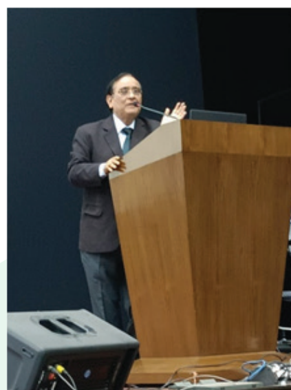
CEO, IIS SSC addressing the audience regarding Apprenticeship scheme at Karigari Bhawan, Kolkata