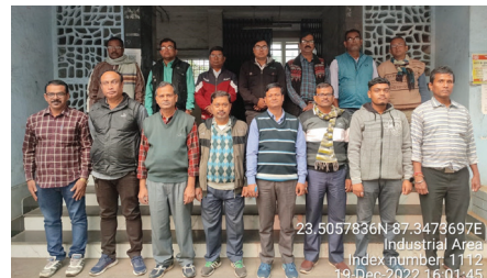
ToT Training Program at Durgapur ITI