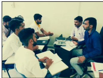
Candidates are facing interview at Churu Rojgar Mela.