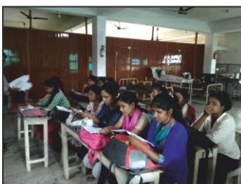
Counselling is going on at Asansol for National Safai Karamcharis Finance & Development Corporation (NSKFDC) Project.