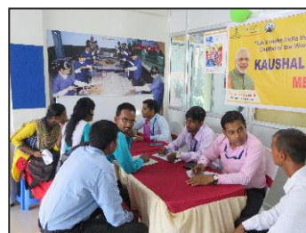
Candidates are facing interview at Bardwan Kalna Rojgar Mela.