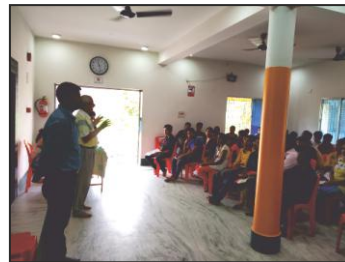
Counselling is going on at Halisahar for National Safai Karamcharis Finance & Development Corporation (NSKFDC) Project.