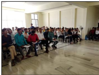
Churu Rojgar Mela.