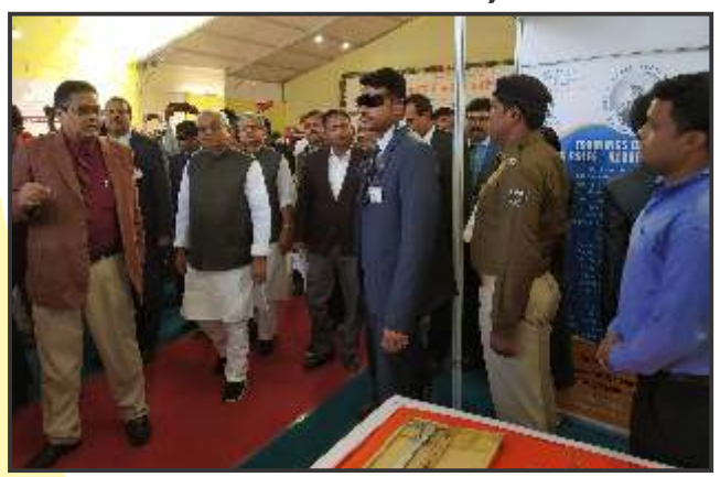
Shri Nitish Kumar, Chief Minister of Bihar in IISSSC stall.