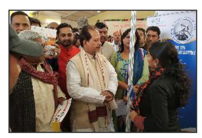
Shri Vijay Kumar Sinha Hon'ble Labour Minister of Bihar interacting with IISSSC official in the stall.