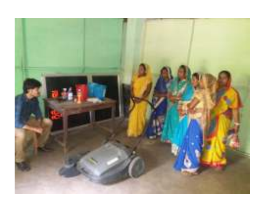
Training is going on IISSSC certified job role for House Keeping with Mechanised Equipments.