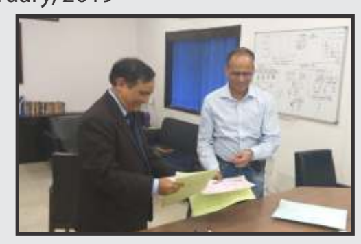
CEO of IISSSC signed an MOU with JN Tata Vocational Training Institute