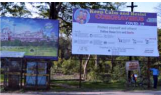
Mass awareness on COVID-19 through billboards