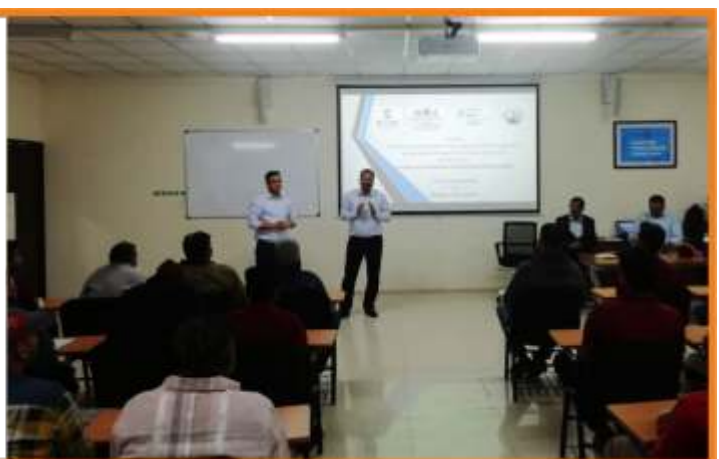
A one day workshop organized by IIS SSC at SIMA