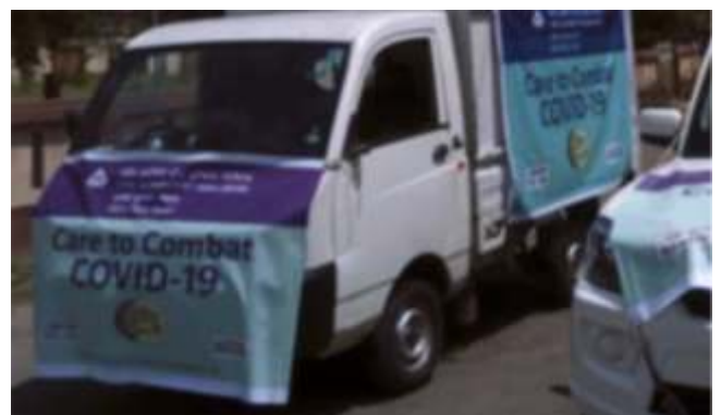
Mass awareness on COVID-19 through deployment of vehicles