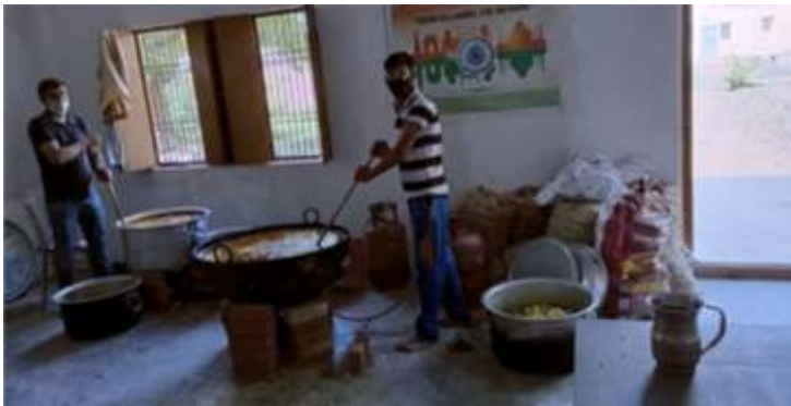
Preparation of meal to be distributed (by Anshika Technical Institute, Training partner of IIS SSC)