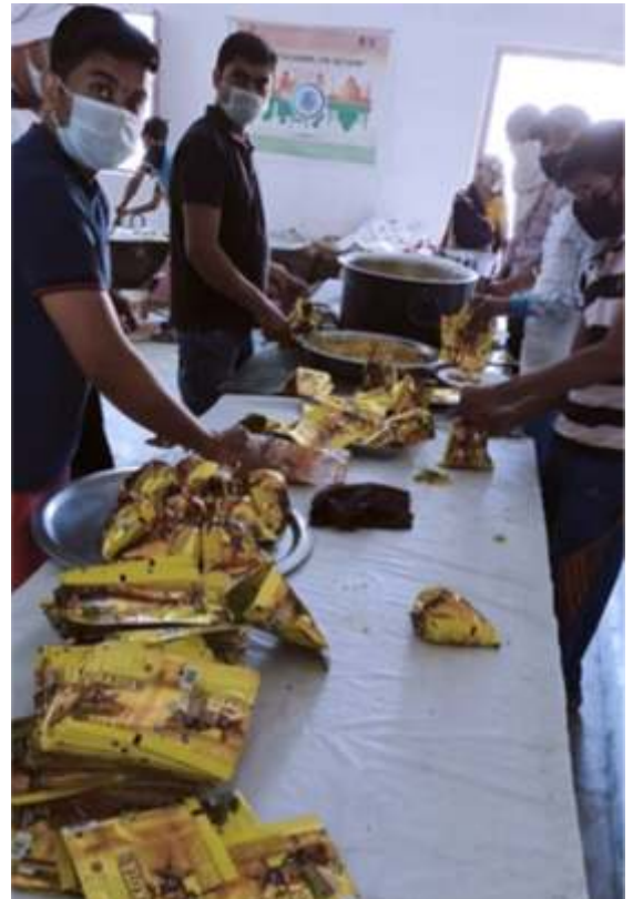
Packaging of food kits for needy (by Anshika Technical Institute, Training partner of IIS SSC)