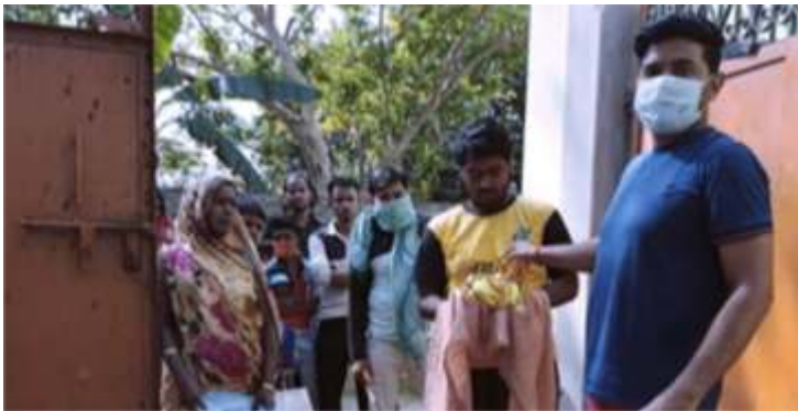
Food kits are being distributed to the needy people (by Anshika Technical Institute, Training partner of IIS SSC)