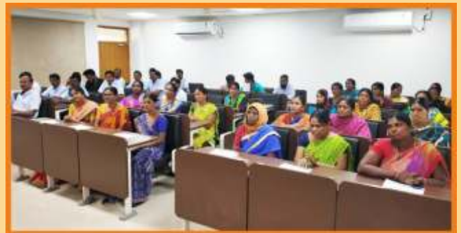
RPL Training & Assessment at Mishra Dhatu Nigam Ltd (MIDHANI) ▲