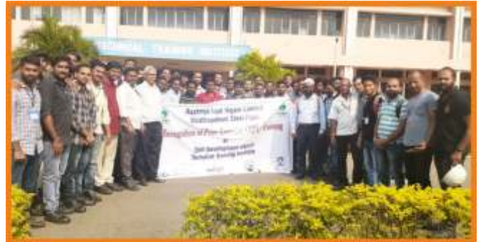
RPL Training & Assessment at RINL Vishakhapatnam ▲