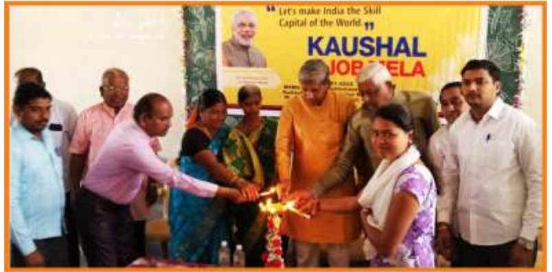
Rojgar Mela organized by IIS SSC at ICA Edu Skills Koppal Center (Karnataka)