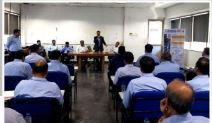
IIS SSC launching RPL 4.0 , a Training programme at Hissar