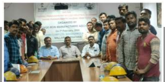
Skill Development Programme at Janki Corporation, Bellary (Karnataka) with support from Sponge Iron Manufacturers Association (SIMA)