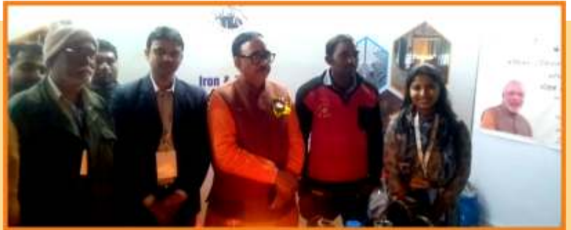
Hon'ble Minister Dr. Mahendra Nath Pandey- Minister for Skill Development & Entrepreneurship (MSDE) Govt. of India MSDE visiting IIS SSC stall and discussing about various activities with IIS SSC Officials.

IIS SSC participated in Kaushal Mahotsav & Rojgar Mela, Varanasi Uttar Pradesh. Our stall was attended by VIPS and some eminent personalities.