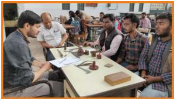
▲ RPL Training & Assessment at SAIL - Bokaro Steel Plant.