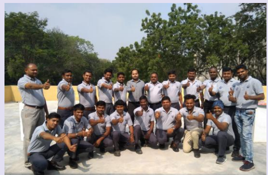
RPL Training for contractual employee of Mishra Dhatu Nigam Ltd.