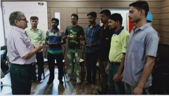
PMKVY RPL 4.0 best in class employee Training & Assessment at Shyam Steel