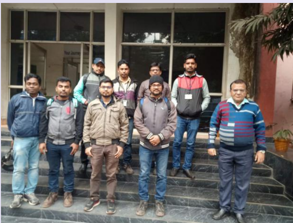
Non PMKVY RPL bridge training at SAIL - IISCO Steel Plant