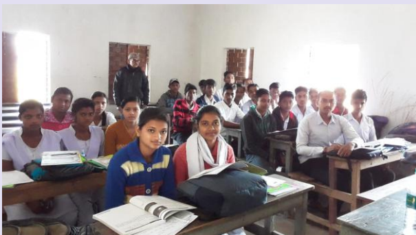
School Assessments Under Directorate of Vocational Education and Training, Government of West Bengal