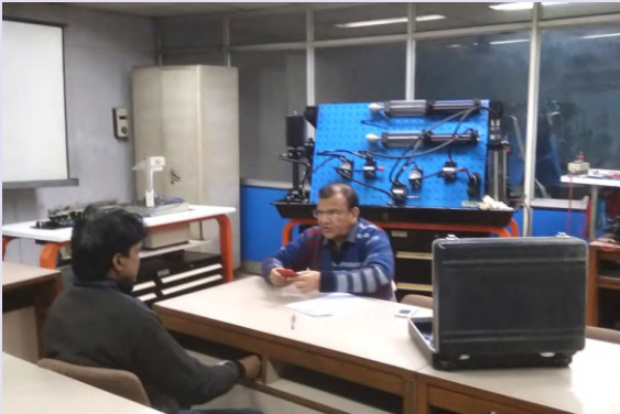
Non PMKVY RPL bridge training at SAIL - Durgapur Steel Plant