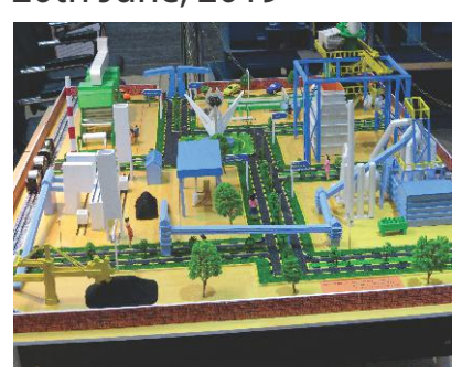
A Model of Steel Plant